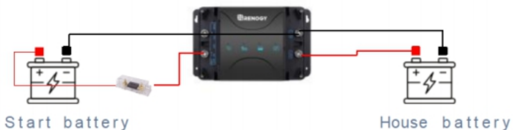
Diagram of fuse connection